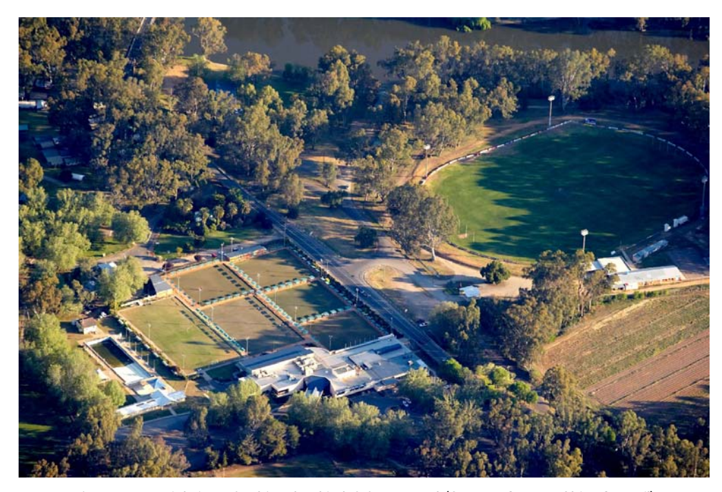
Figure 4 – Aerial view of subject land in left foreground