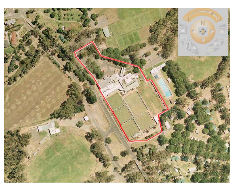
Figure 2 – Subject land