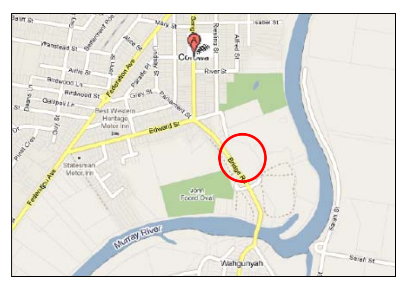
Figure 1 – Location of subject land within the context of Corowa.

The Planning Proposal has been prepared in accordance with the Department of Planning's A Guide to Preparing Planning Proposals ("the Guide") and other information specified in Council's consultant brief.